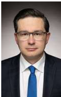
Pierre Poilievre Conservative Party