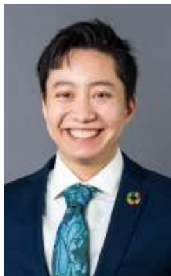
Amita Kuttner Green Party