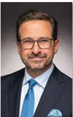
Yves-François Blanchet Bloc Québécois