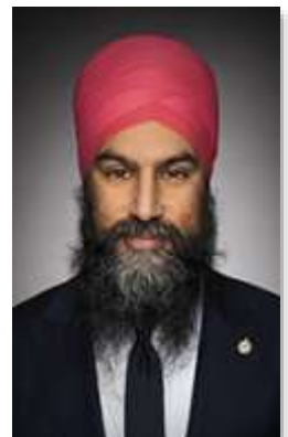
Jagmeet Singh New Democratic Party