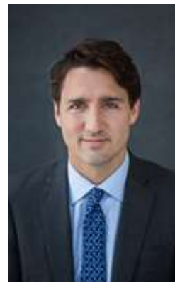
Justin Trudeau Liberal Party